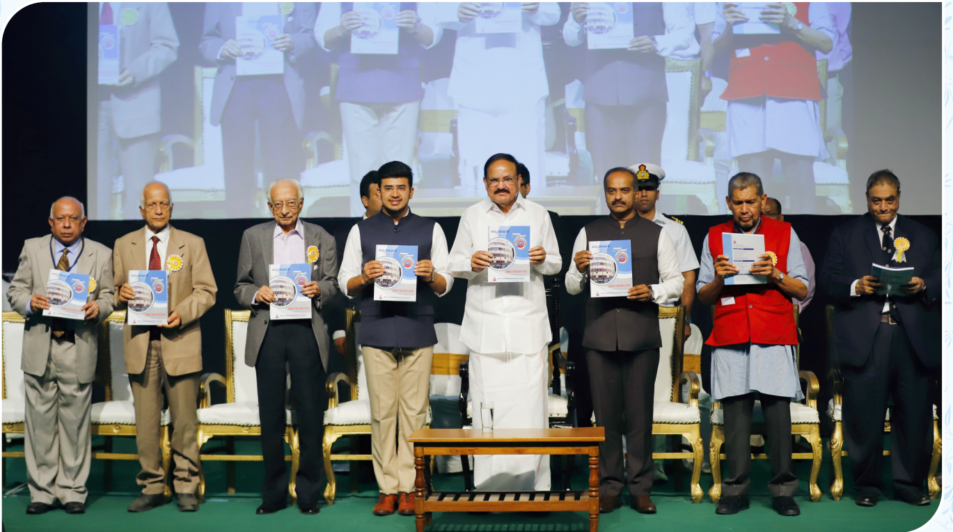
Release of AMRUTHA VARSHINI - Platinum Jubilee Souvenir