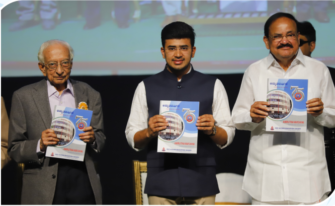
A Proud Display of the Souvenir