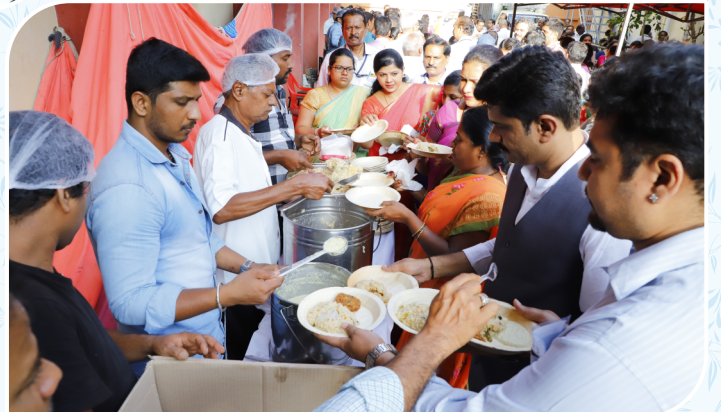
At Food Court