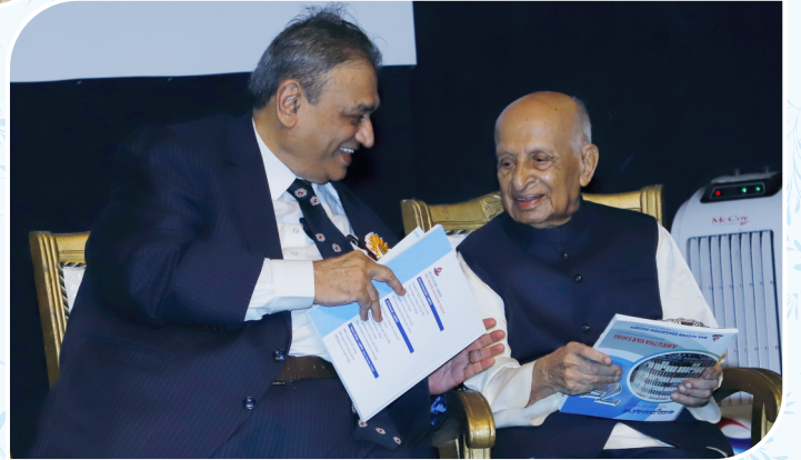
Educationists sharing a light moment