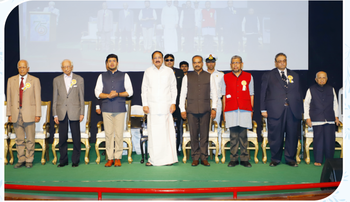
Dignitaries on the Dias