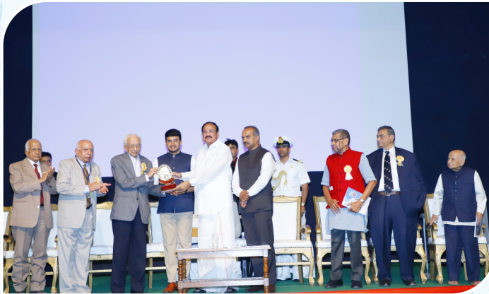
Moment of presenting a memento to The Vice-President of India