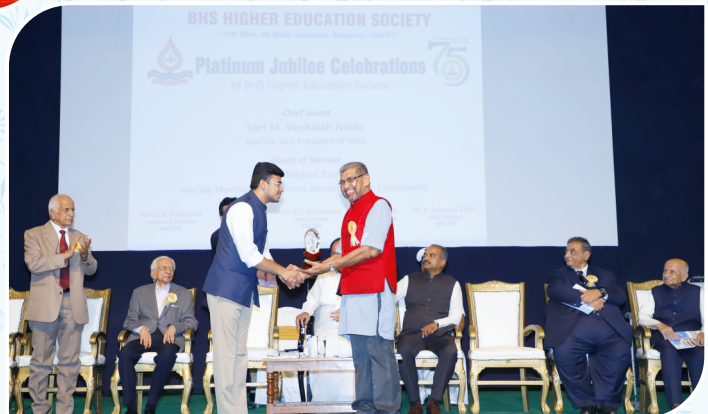
Sri Tejasvi Surya Felicitated