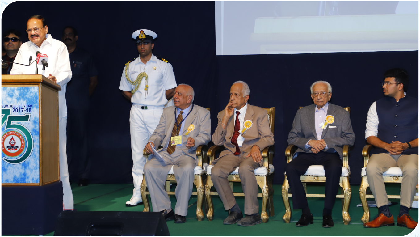
Sri Venkaiah Naidu, Honourable Vice-President of India addressing the gathering