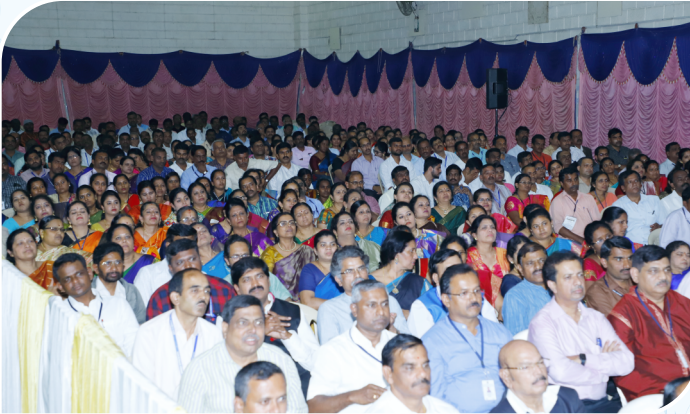
In rapt attention