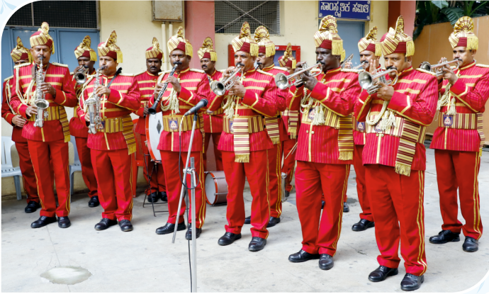
Police Band Welcoming the Chief Guest